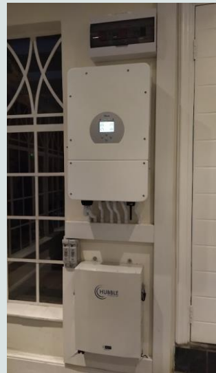
4,8kWp DC - 8kW Inverter - 5.5 kWh Battery Hybrid Install