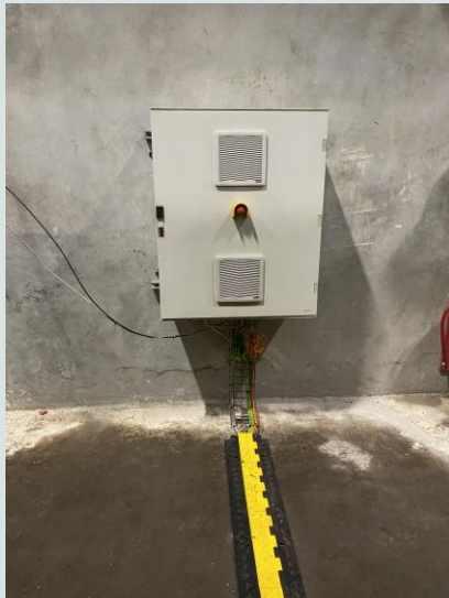
Control panel Installation