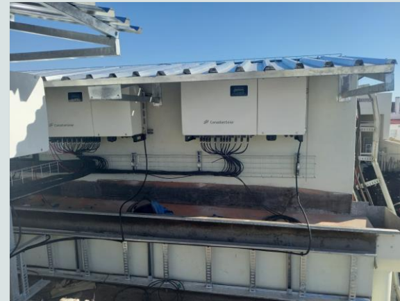
Inverter & string wiring on 730kWp DC install