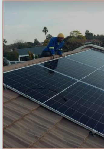
4,5kWp DC Hybrid Install