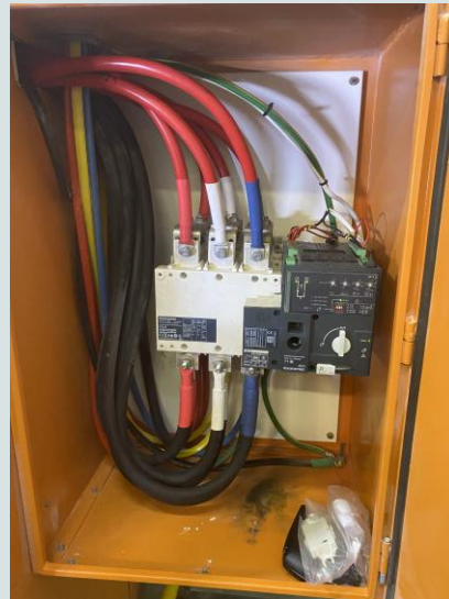
Change Over Installation