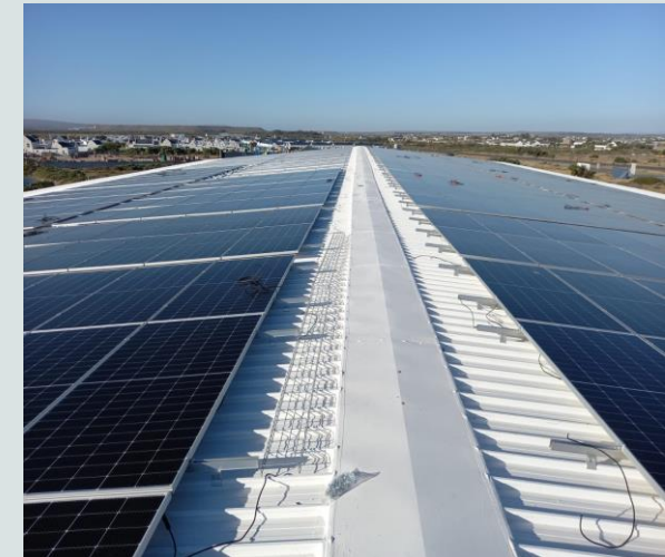
730kWp DC Grid Tie Install