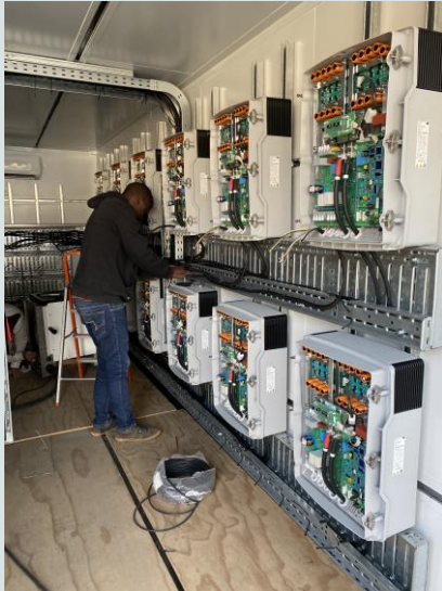
Containerized Inverter Station