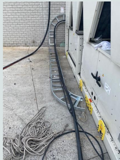
Chiller Supply cable install