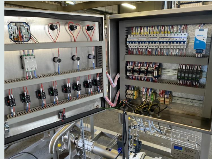
Gel Mixer control panel