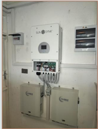
4,8kWp DC - 8kW Inverter - 11 kWh Battery Hybrid Install