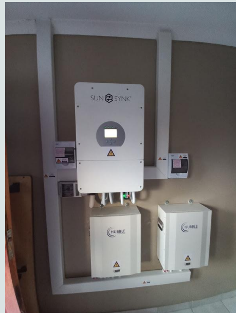
4,4kWp DC - 8kW Inverter - 11 kWh Battery Hybrid Install