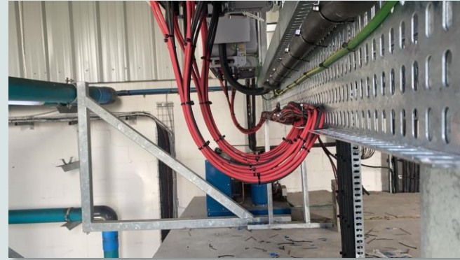
String Wiring on 550kWp DC Install