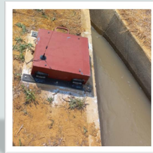
Remote water level sensing